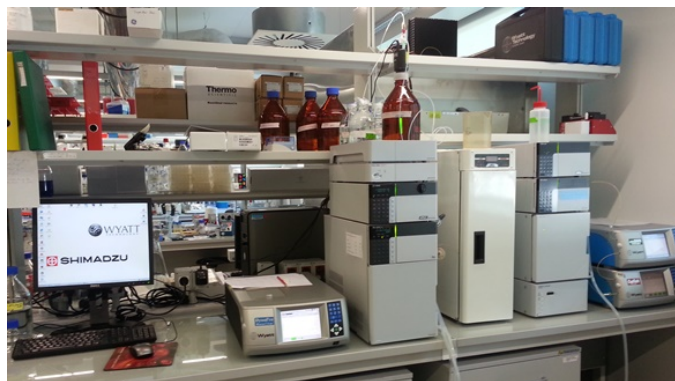
Picture of the SEC/MALS equipment