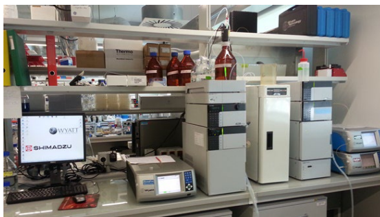
Picture of the SEC/MALS equipment